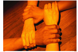
Working together to bring the Gospel to women inmates at Coffee Creek.