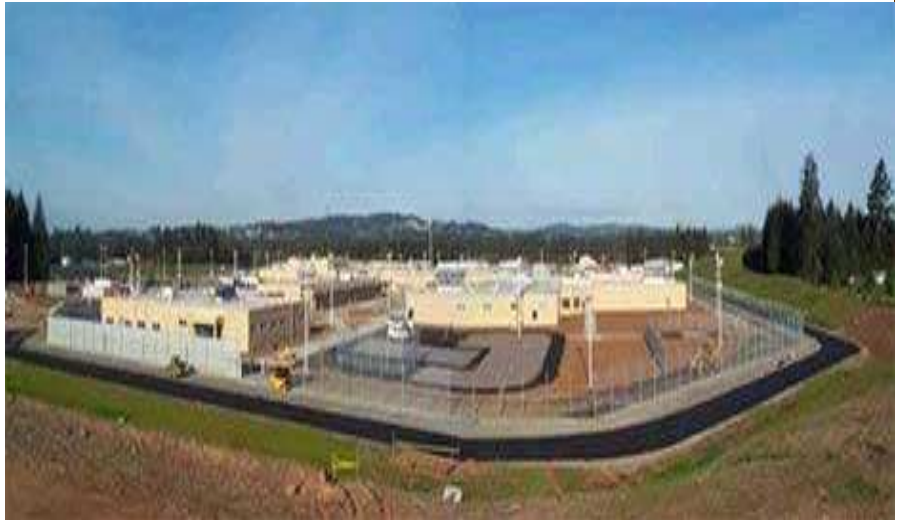
Coffee Creek Correctional Facility in Wilsonville, Oregon.

To contact us... Oregon Women's Prison Ministry P. O. Box 91186 Portland, OR 97291 E-mail: owprisonministry@hotmail.com