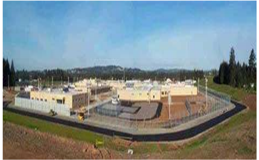
Coffee Creek Correctional Facility