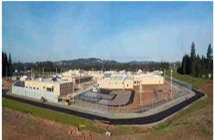
Coffee Creek Correctional Facility in Wilsonville, Oregon

rest in the first place. The OWPM mission home would provide housing, but also support and mentoring for that vital transition period between prison and successful living on the outside.