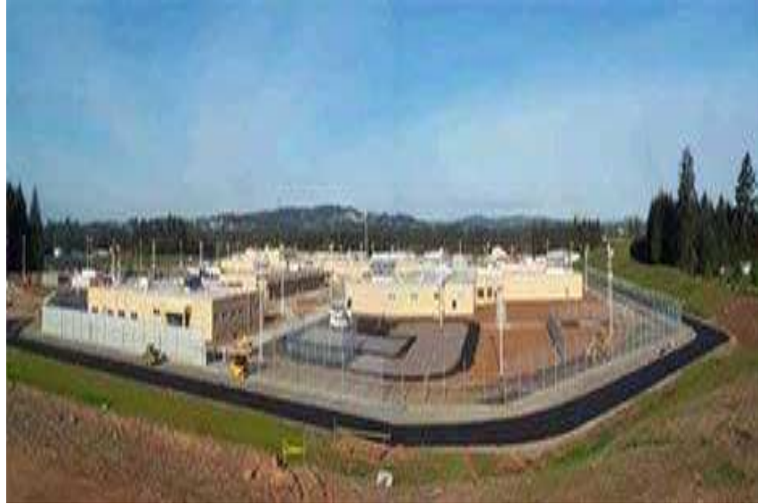
Coffee Creek Correctional Facility—Wilsonville, OR

If you would like to make a donation, you can do so through the website at www.owprisonministry.org Just click on the Pay Pal link!