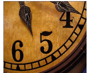
Time Waits for No One