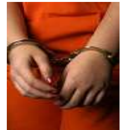
Only Jesus can heal the pain that comes with incarceration.

Then why did I feel, I needed to run? A loud voice came to me, one dreary day Instructed me once more, to come out and play I sat there that day, and searched my sick soul Afraid I had lost it, and it left a big hole I cried and I cried, and I screamed out God's name I told Him my soul's gone, and myself was to blame But Jesus came closely, and told me to rest Just learn from your life, all this was a test He said that my soul, was lost one long day To me it was years, my hair had turned gray So I had to live, through life as I had To learn what is good, to learn what is bad And when I had reached, the top of my hill Instead of jumping, I did something real I dropped to my knees, and screamed out His name The only one pure, and without any blame. The only one who could fill up my hole Yes, Jesus came down to heal my sick soul.