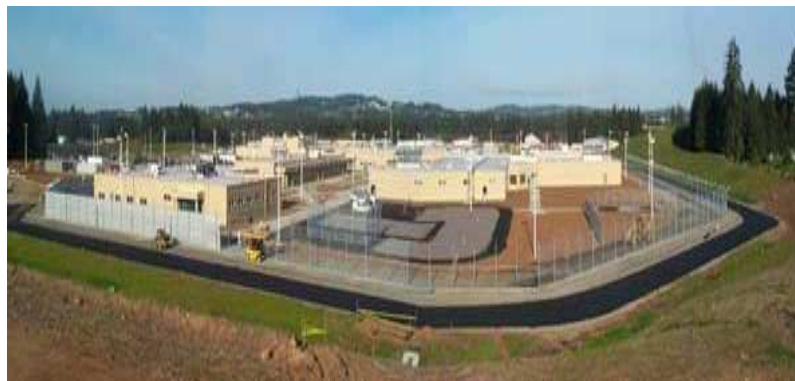
Coffee Creek Correctional Facility