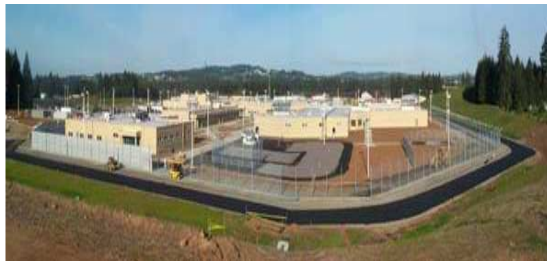
Coffee Creek Correctional Facility